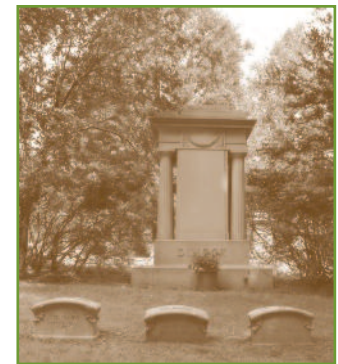
William Glackens Lot