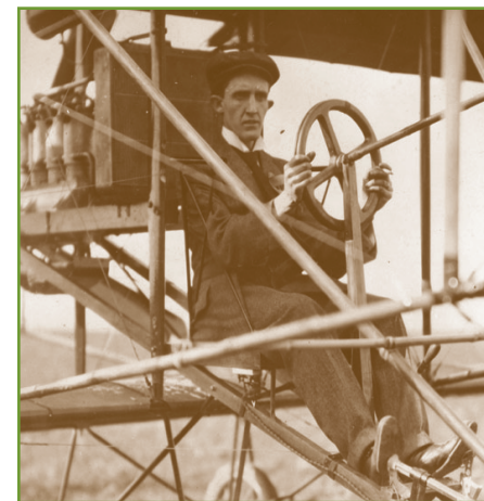
The Barnstormers & Aviators video and webpage highlight aviation innovators including Charles Hamilton seen above.

The Foundation has developed online materials featuring highlights from canceled programs. New webpages and videos provide a virtual way to enjoy the cemetery.