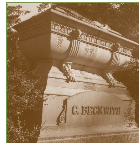
A new video tells the story of Titanic survivor Richard Beckwith.

The online exhibition Remarkable Women showcases some of the extraordinary women laid to rest