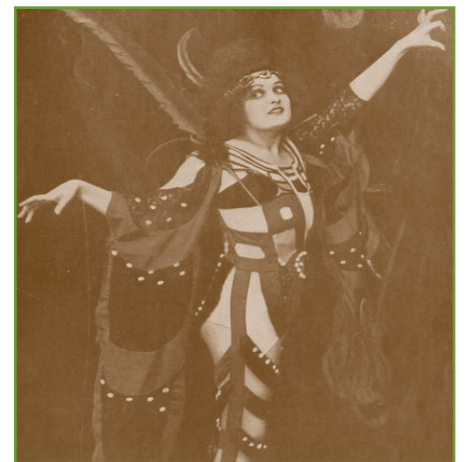
Actress Fern Andra, the "Mary Pickford of Germany," is included in the Remarkable Women online exhibition.

Visit our website, cedarhillfoundation.org , for links to all new content.