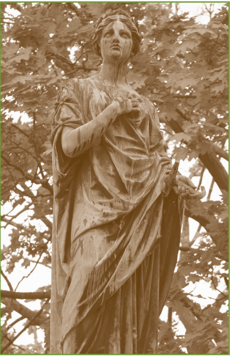
The Jewell Monument, featuring a bronze Statue of Hope, is one of many exceptional examples of memorial art at Cedar Hill.