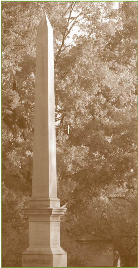
The Day Monument on Section One

According to the Courant , the Day obelisk was the largest monument based on the Lateran model in the United States. It measures nearly 8 ½ feet square at the base with a total height of about 40 feet.