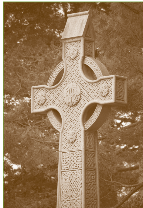
Celtic Cross ~ check out our video about the history of this popular monument style

Contributions made by September 30th will be recognized in the Foundation's next Annual Report .