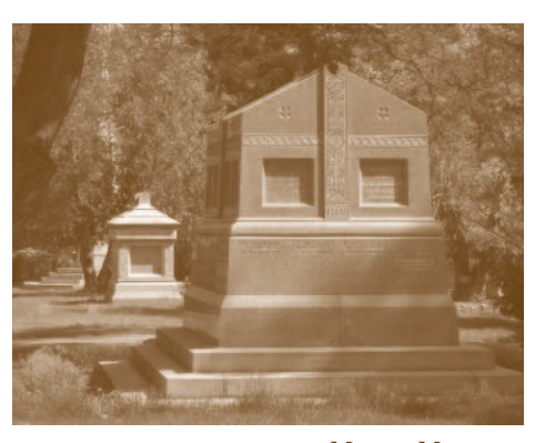
Morgan Monument

Your support and generosity are sincerely appreciated. Together, we can ensure Cedar Hill remains an inspiring landscape for all who visit.