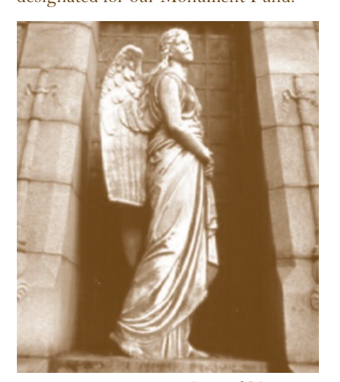
Howard Monument

Thank you to the William and Alice Mortensen Foundation for its generous grant support of the Howard monument restoration. The Mortensen Foundation awarded Cedar Hill a $6,250 grant which we seek to match with donations designated for our Monument Fund.