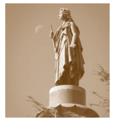
Samuel & Elizabeth Colt Monument

Admission is $5.00 and free for Cedar Hill Cemetery Foundation members.