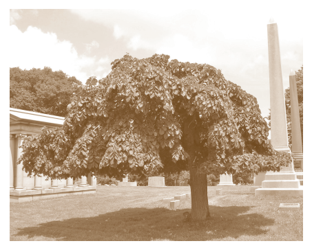
Camperdown Elm - a weeping elm tree with twisted branches and dense foliage

Many of Cedar Hill's trees have graced our memorial grounds for 150 years. The historic October 2011 snowstorm, subsequent inclement weather, and age have taken their toll.