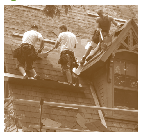
The steeply-pitched roof of the Gothic Revival Cottage made installation more complicated than a standard roof.

Cedar Hill Cemetery Foundation received grants from the 1772 Foundation in partnership with Preservation Connecticut and the William and Alice Mortensen Foundation to support the Cemetery's preservation efforts.