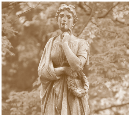
The female figure represents memory, which is denoted by the wreath in her hands.

Most angels in American cemeteries are rooted in Christian tradition. Although there are Biblical references to angels, there are no physical descriptions included in the text. Early representations on sarcophagi depict angels as young men.