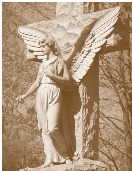
This angel may be the work of the Smith Granite Company of Westerly, Rhode Island.