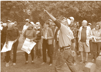
Our annual Tree Walk takes place the first Saturday in June

Cedar Hill collaborates with numerous organizations to present programming at the cemetery. This year we are delighted to be teaming up with several new partners to present engaging activities.