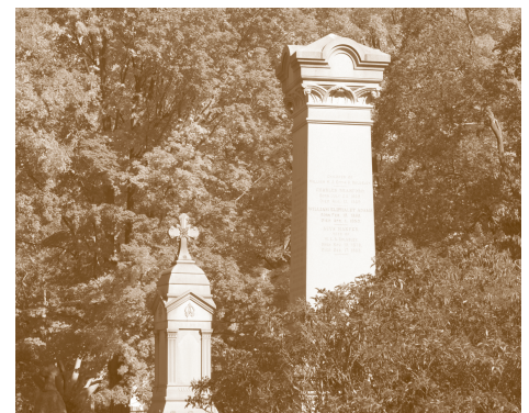
Fall Morning, Cedar Hill

Your support and generosity are sincerely appreciated. Together, we can ensure Cedar Hill remains an inspiring landscape for all who visit.