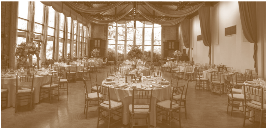
Pond House, Elizabeth Park