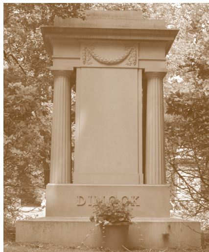
Ira Dimock and his family will be included on the new Celebrate West Hartford tour.

Our Calendar of Events , with program descriptions, will be published in March. You can pick up a copy at the cemetery – either in the brochure rack just past the large planter as you enter the property or in the office located in the former chapel (Monday-Friday, 8:00 am-4:00 pm). Program dates and details can also be found on our informative website, www.cedarhillfoundation.org .