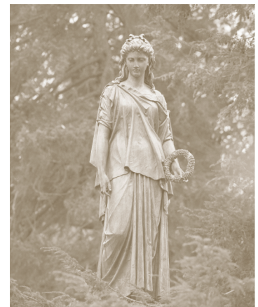
With generous public support, Cedar Hill Cemetery Foundation restored the Oswin Welles Monument in 2006.