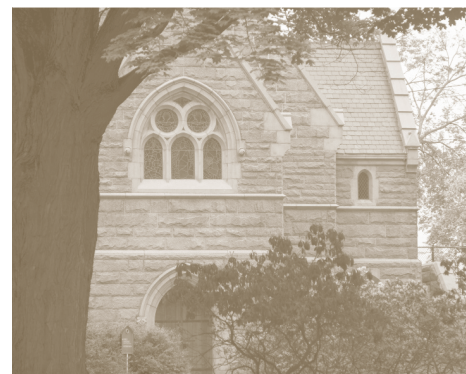
Northam Memorial Chapel

Your support and generosity are sincerely appreciated. Together, we can ensure Cedar Hill remains an inspiring landscape for all who visit.