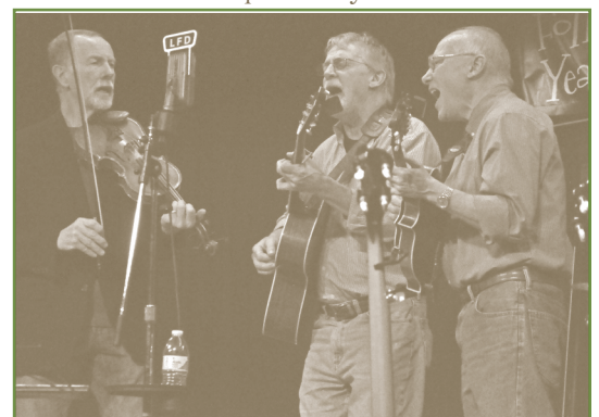
Last Fair Deal

This free concert is made possible through the generous support of the Evelyn W. Preston Memorial Trust Fund, Bank of America, N. A., Trustee. We are very grateful to the Preston Fund who has supported Music Among the Memorials for the past five years.