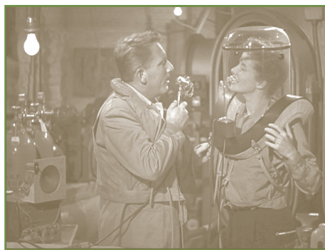
Katharine Hepburn & Spencer Tracy star in the 1945 comedy Without Love

Admission is $5.00 per person and free for Foundation members. Free popcorn while supplies last. The rain date is Friday, August 24 at 7:30 pm.