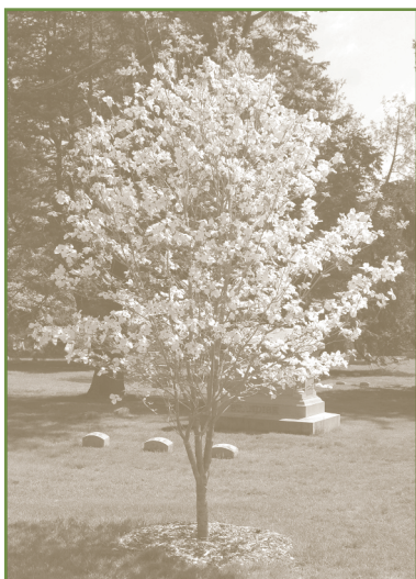
A dogwood tree planted with the support of the Foundation's Tree Fund

Cedar Hill boasts over 2,000 trees representing more than 100 species and varieties creating an urban oasis for the city of Hartford. If you have visited the cemetery recently, you probably noticed extensive tree trimming activities throughout the grounds.