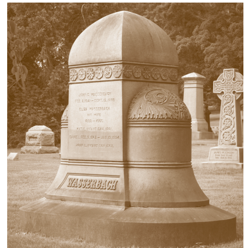
The Wasserbach Monument in Section 4 will be cleaned this spring.

Thank you again for supporting this important preservation project.