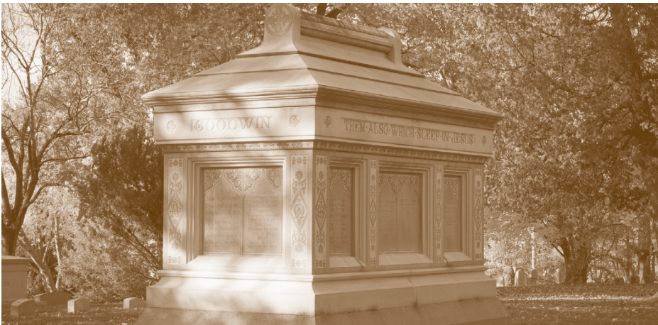
Join us for The Green Team on May 21. Highlights include the designer of Bushnell Park, the family behind Wickham Park, a philanthropist dedicated to city parks, and more on this new walking tour.