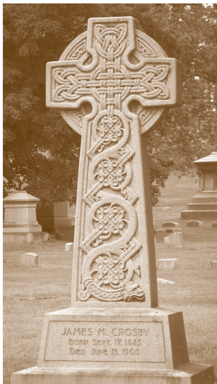
The Stories in Stone walking tour on June 15 will highlight popular 19th-century monument styles including the Celtic Cross.

Hallowed History Lantern Tour require advanced reservations to participate. Lantern Tour tickets go on sale online on September 1.