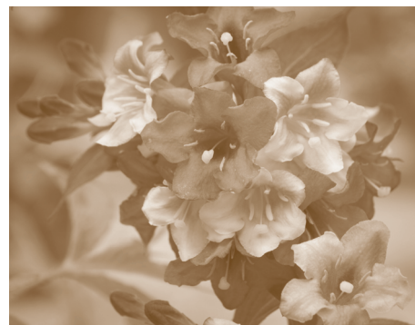
Spring flowers at Cedar Hill

Your support and generosity are sincerely appreciated. Together, we will ensure Cedar Hill remains an inspiring landscape for all who visit.