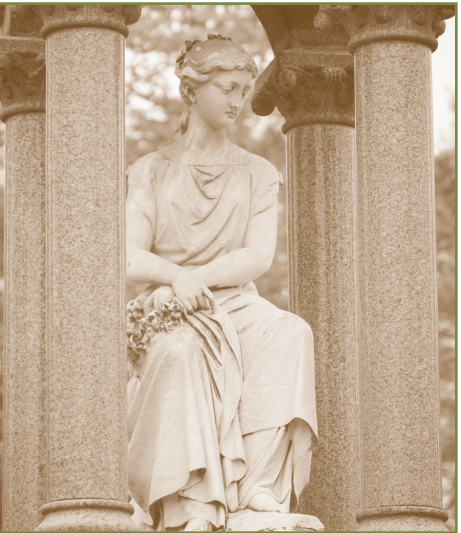
Cedar Hill Cemetery's monuments are creative expressions of 19th-century funerary art.

The short video showcases Cedar Hill's inspiring landscape of history, art, and nature. Highlighted on the